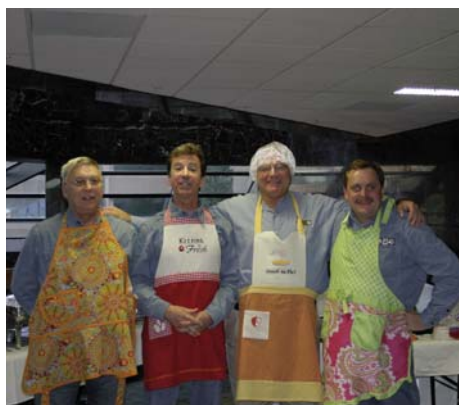
Iroquois executives wear their aprons proudly