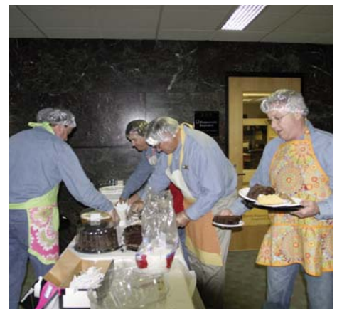
Iroquois executives serve up the sweets

At the finale thank you luncheon, Iroquois' executive team served dessert tableside to employees. In total, the Valley United Way will receive over $67,700 as a result of Iroquois' campaign.